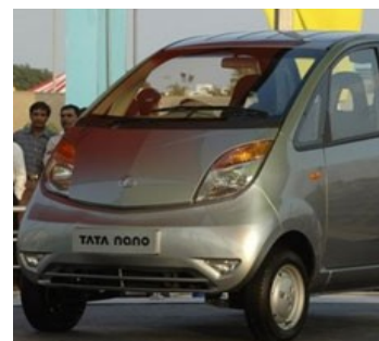
Tata Motors launched its people's car, Nano, promising to stick to the Rs 1,00,000-price tag for the base model.

For more information, contact: Sachin Tuli tuli@bus.wisc.edu